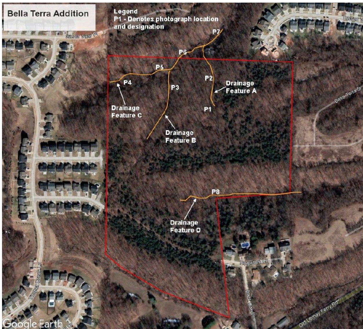
Figure 1: Resource Map

SUBJECT: Pre-2015 Regulatory Regime Approved Jurisdictional Determination in Light of Sackett v. EPA , 143 S. Ct. 1322 (2023), MVS-2025-667